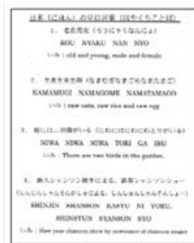
Figure 5. Japanese tongue twisters by Kimura

Moreover, learners in face-to-face tandem sometimes prepared materials for their partners. Figure 5 is an example of Kimura's "present" for his partner, Arnold. Kimura prepared a handout of Japanese tongue twisters because Arnold asked about it in the previous session.