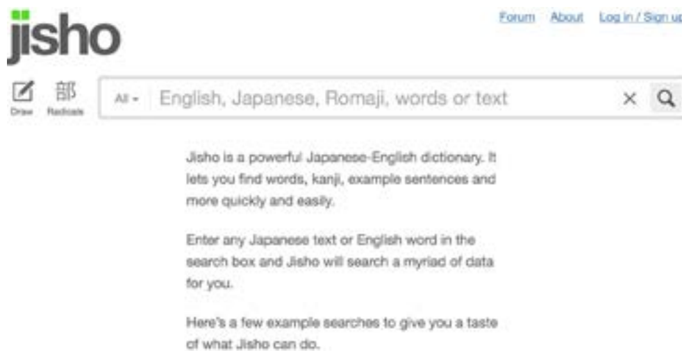
Figure 4. Lea's online dictionary ( http://jisho.org )

On the other hand, learners in eTandem tended to rely first on online or electronic dictionaries when their communication broke down. They often asked their partners to wait while they tried to look up the appropriate words by themselves. When learners were unable to catch a word, they would first ask their partner to write down the word or phrase in the chat window, and then the learner would look it up in a dictionary. Figure 4 shows the search bar of the free online dictionary which Lea often used during her sessions.